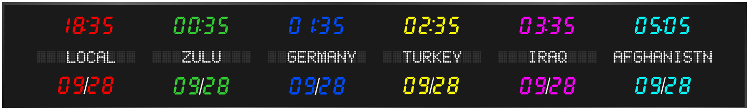
Model 6613M - 1.8" bar segment time & date, 1.2" zone labels, 6 zones